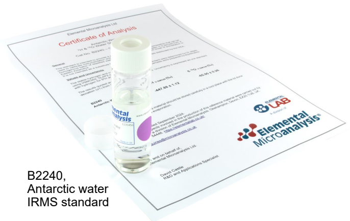
B2240, Antarctic water IRMS standard

When you purchase Elemental's IRMS water standards, you are purchasing the same standards Elemental Lab uses every day in our UKAS 17025 accredited analytical laboratory. All products that Elemental Microanalysis manufactures in-house use our ISO 9001:2015 accredited quality system.